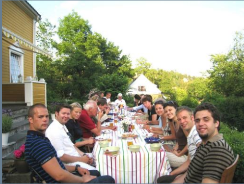
Garden party – meeting Rotarians and Rotaracts in a social setting