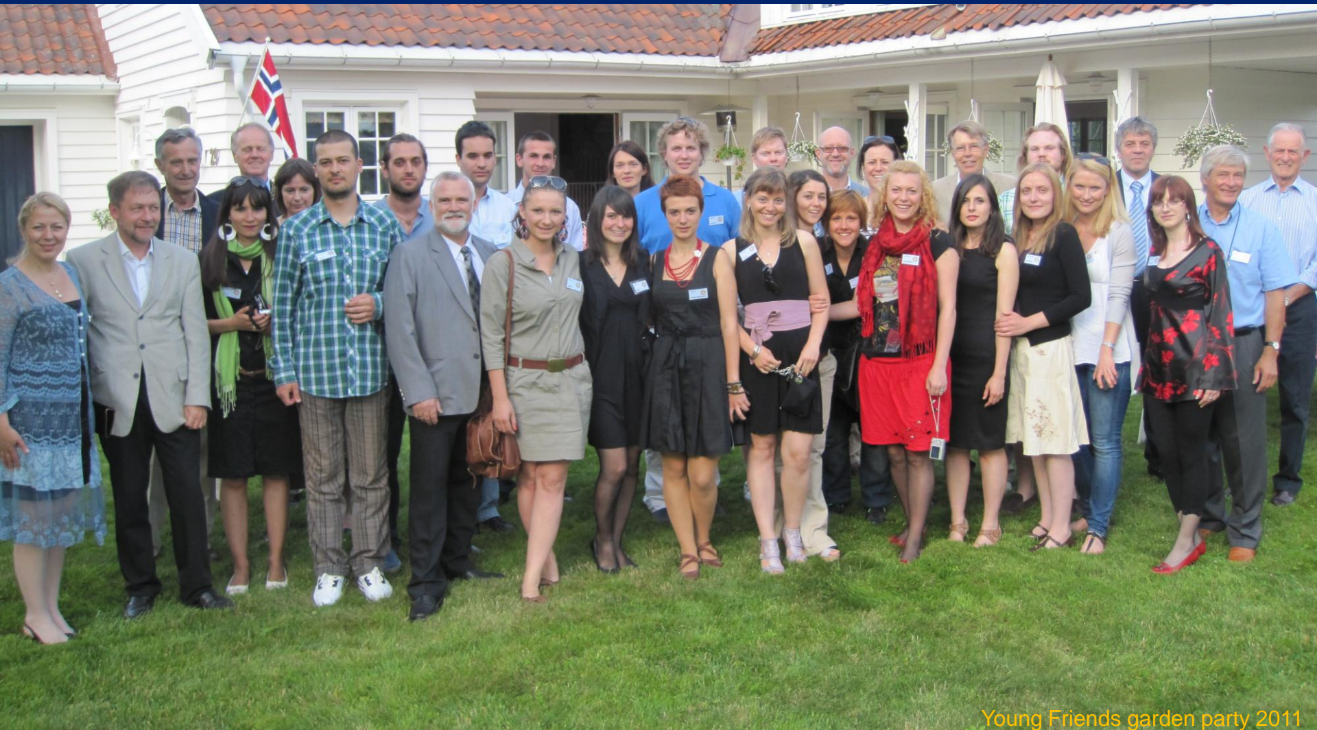
Young Friends garden party 2011