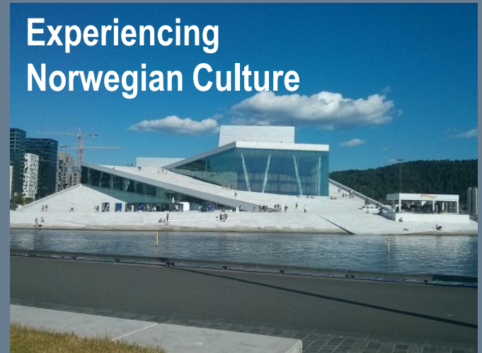
Experiencing Norwegian Culture